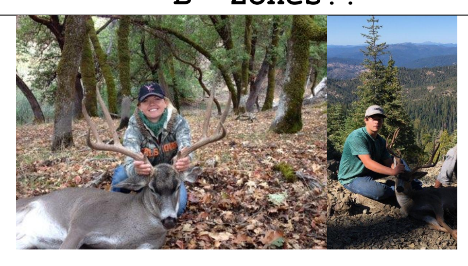
Success in the Field! ~~On Site Habitat Improvement and Evaluation Projects~~

LOCAL DOLLARS to help restore our vanishing blacktail herds! Make a difference in the "B" Zones!!